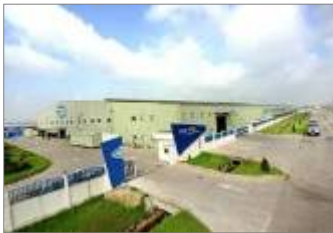
1 st vietnam factory – hanoi