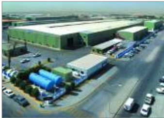
HQ dammam, saudi arabia

8 factories and 62 offices across Asia. Africa, Europe and Oceania