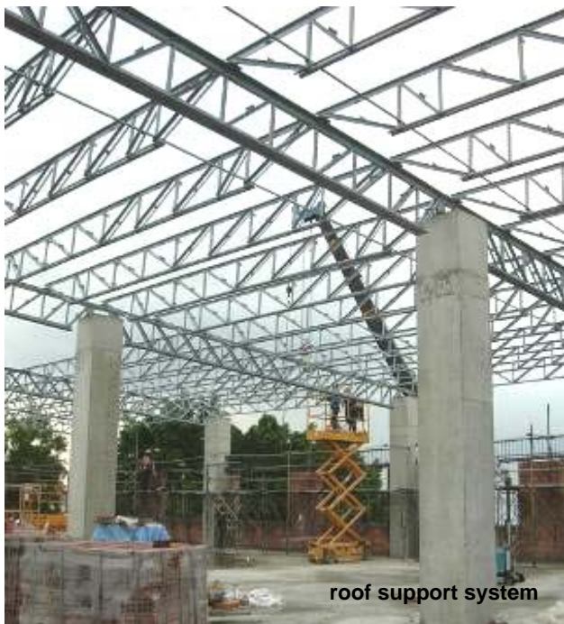
roof support system