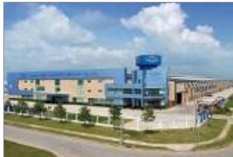
2 nd vietnam factory – dong nai